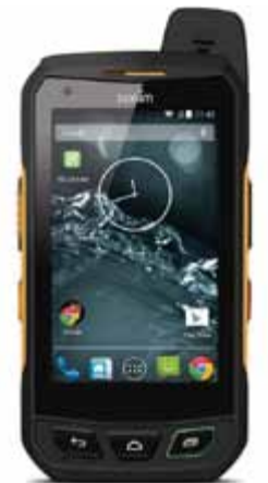
Sonim XP7 Rugged Smartphone

Enjoy Enhanced Push to Talk (EPTT) instant communications anywhere on the AT&T Network!